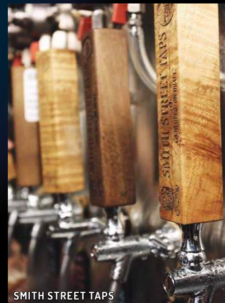
SMITH STREET TAPS

#02-62 Chinatown Complex, 335 Smith St., 9430-2750, fb.com/smithstreettaps