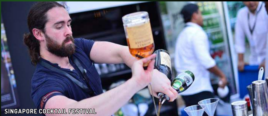
SINGAPORE COCKTAIL FESTIVAL