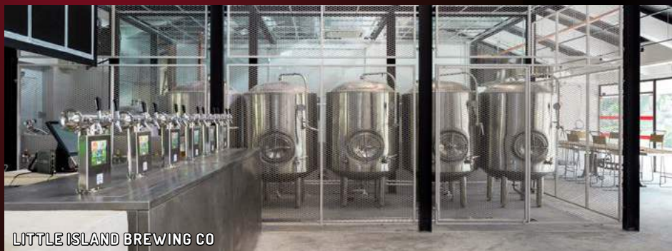
LITTLE ISLAND BREWING CO