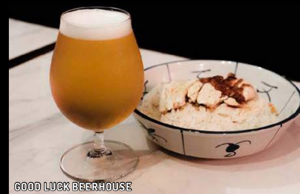
GOOD LUCK BEERHOUSE