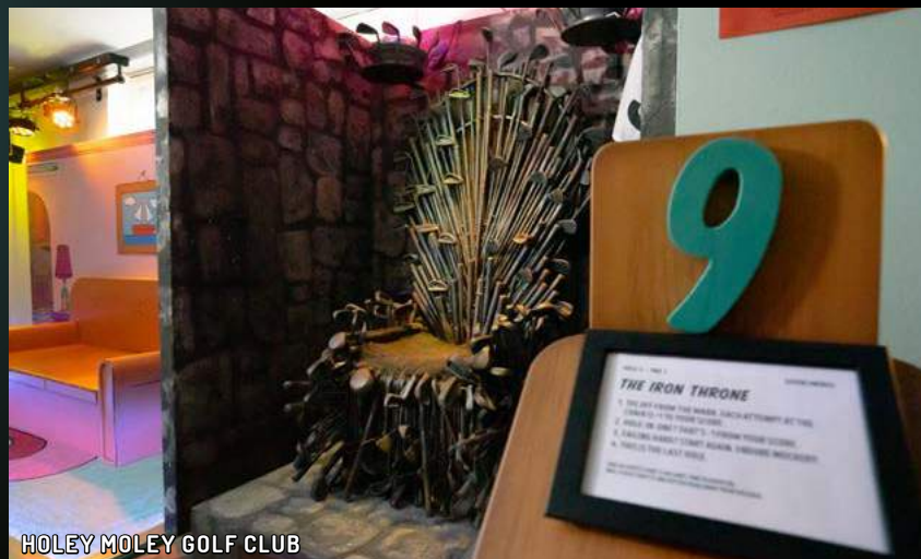
HOLEY MOLEY GOLF CLUB

25 Boon Tat St., 6221-3665, sumyitai.com