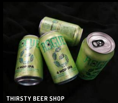
THIRSTY BEER SHOP

#05-01ION Orchard, 2 Orchard Turn, 8809-0038, the-grande-whisky-collection.business.site