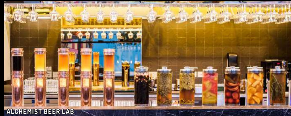
ALCHEMIST BEER LAB