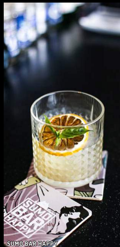
SUMO BAR HAPPY

#01-24 Waterloo Centre, 261 Waterloo St., sumobarhappy.com