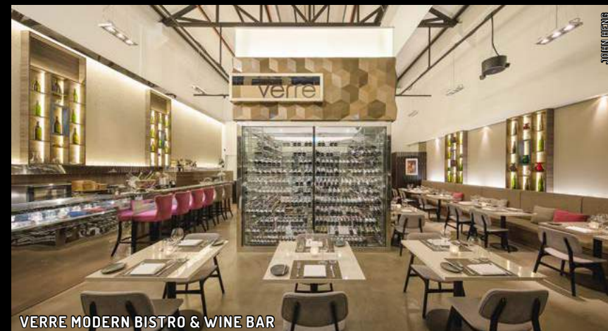
VERRE MODERN BISTRO & WINE BAR

#01-05/06 8 Rodyk St., 6509-1917, verre.com.sg