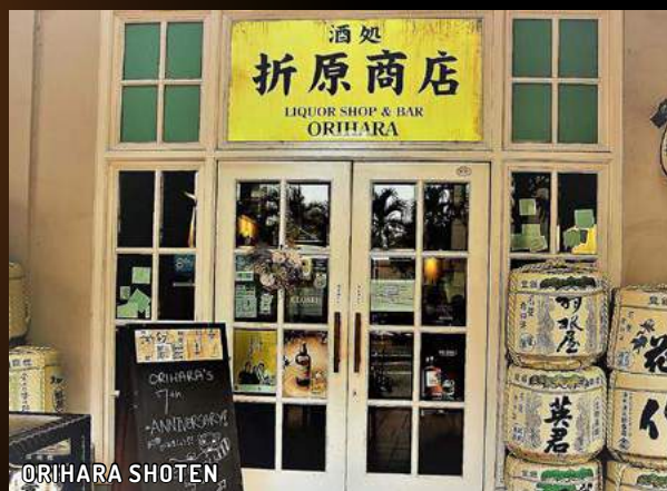
ORI HARA SHOTEN

#01-01/02 Robertson Walk, 6836-5710, fb.com/oriharashouten