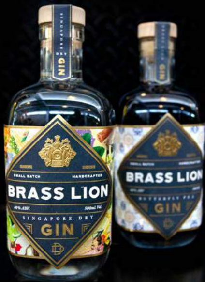
BRASS LION DISTILLERY