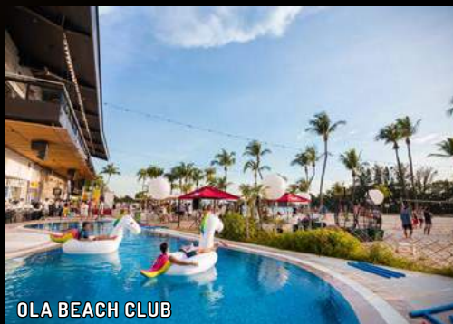
OLA BEACH CLUB