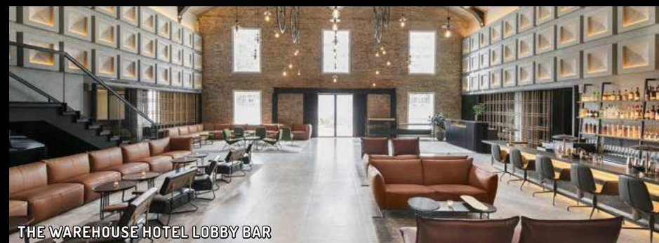
THE WAREHOUSE HOTEL LOBBY BAR