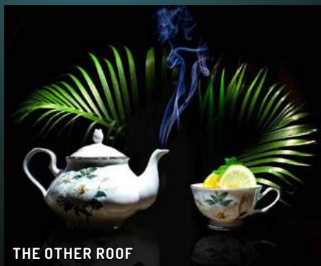
THE OTHER ROOF