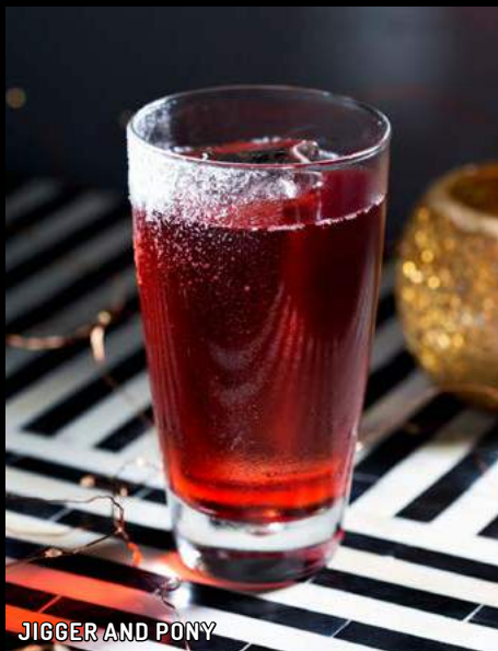
JIGGER AND PONY

6/F Amara Singapore, 165 Tanjong Pagar Rd., 9621-1074, jiggerandpony.com