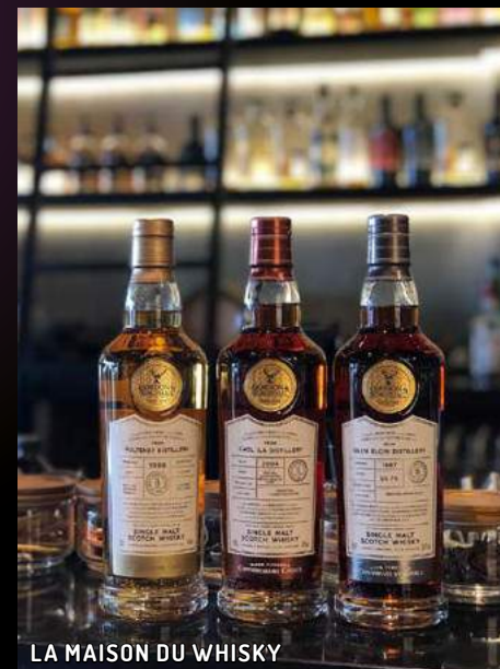
LA MAISON DU WHISKY

#02-02A Rendezvous Hotel Gallery, 9 Bras Basah Rd., 6337-2201, theauldalliance.sg