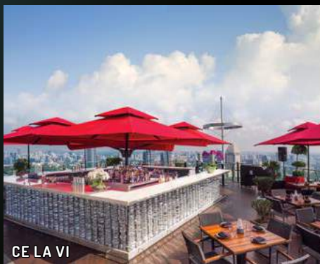
CE LA VI