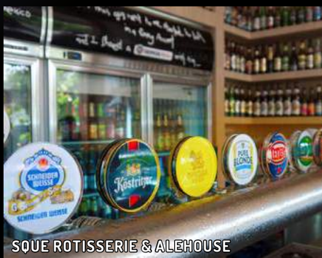
SQUE ROTISSERIE & ALEHOUSE

Maxwell Food Centre and Old Airport Road Food Centre. Keep up with their events on Facebook.