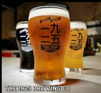
THE 1925 BREWING CO