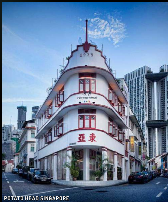
POTATO HEAD SINGAPORE