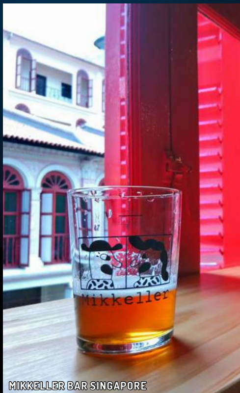
MIKKELLER BAR SINGAPORE