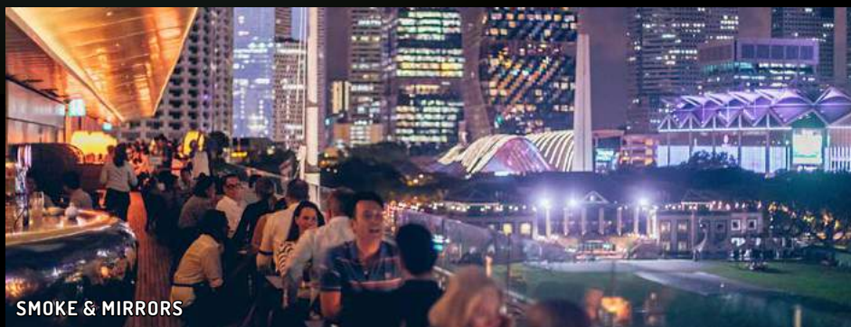
SMOKE & MIRRORS