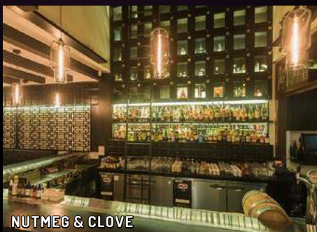
NUTMEG & CLOVE