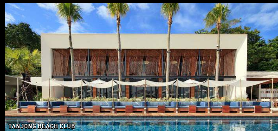
TANJONG BEACH CLUB