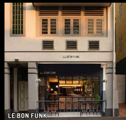
LE BON FUNK