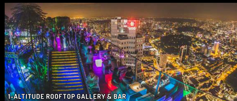
1-ALTITUDE ROOFTOP GALLERY & BAR