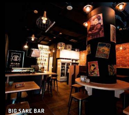
BIG SAKE BAR

#01-02 The Concourse Skyline, 302 Beach Rd., 6291-2700, bigsakebar.com