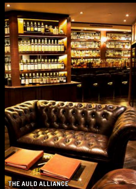
THE AULD ALLIANCE