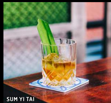
SUM YI TAI