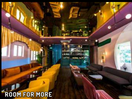
ROOM FOR MORE

Saturdays & Malt Mondays program — where they offer special single malts by the glass — and regular tasting events.