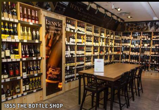
1855 THE BOTTLE SHOP

43A HongKong St., 8228-0113, ecproof.com