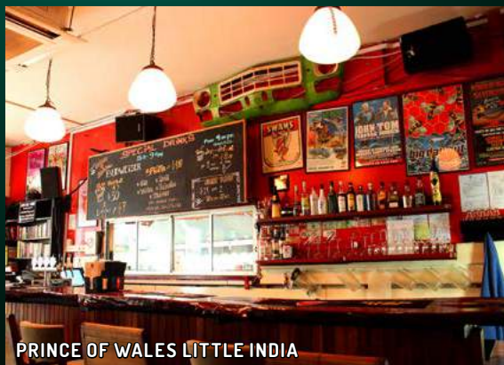
PRINCE OF WALES LITTLE INDIA