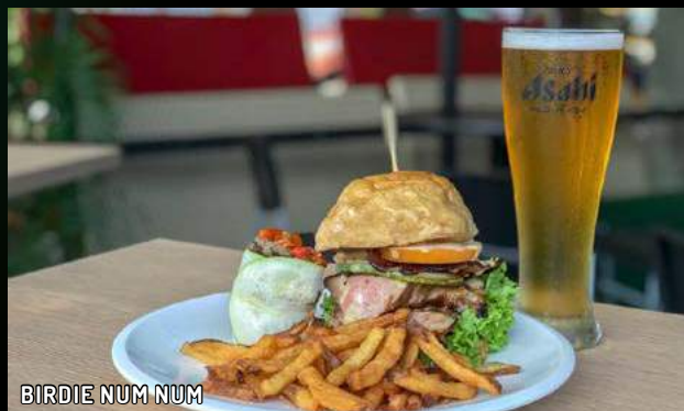
BIRDIE NUM NUM