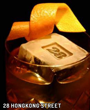
28 HONGKONG STREET