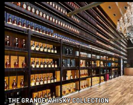
THE GRANDE WHISKY COLLECTION